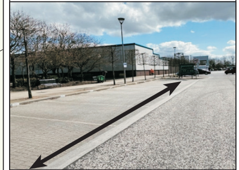
Shoosmiths Client Spaces (View from Shoosmiths' Building)