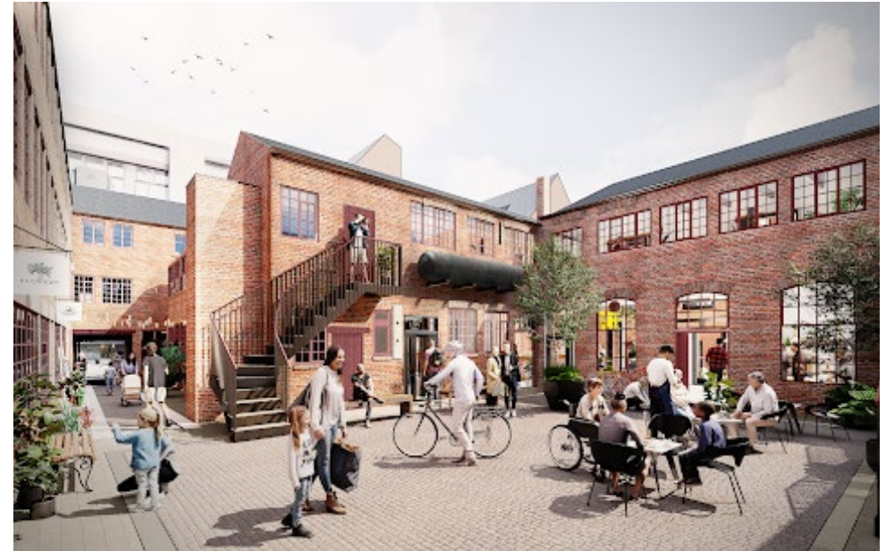
Leah's Yard – Heart of the City Space for community, independent local businesses, social entrepreneurs & makers