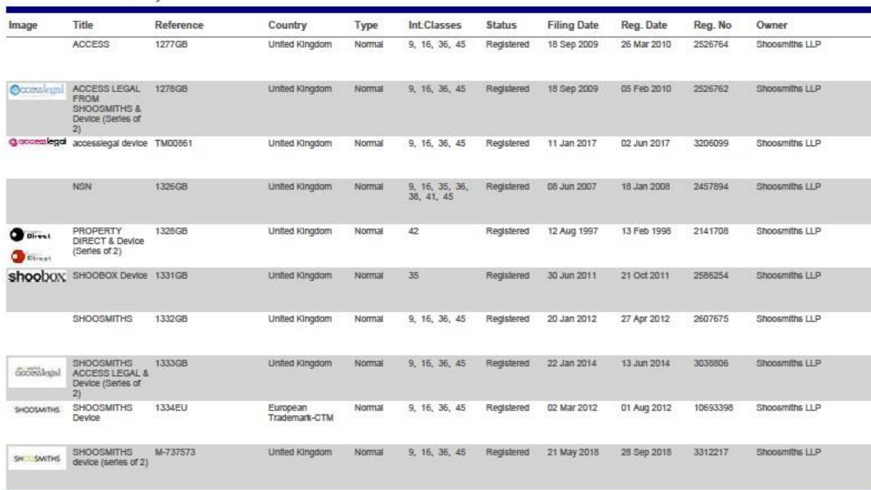
Trademark Case List - by Title